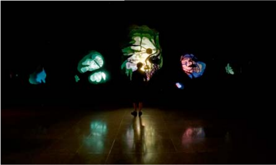
Sometimes in My Dreams I Fly , 2010